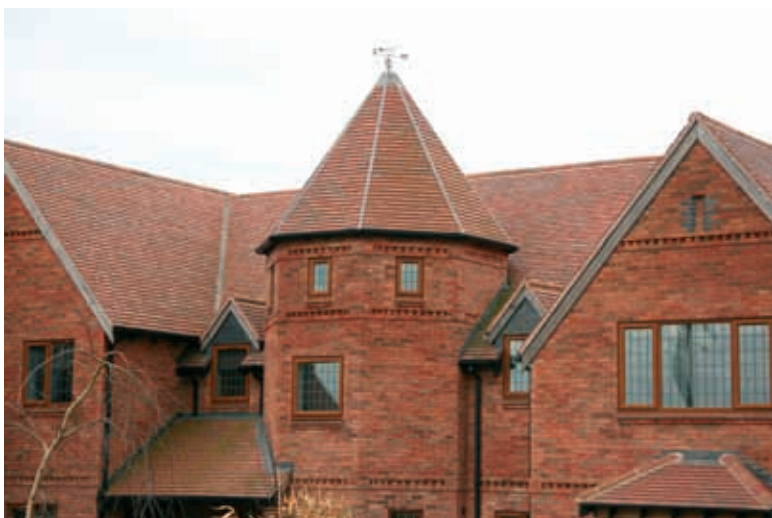
Left: Brown Antique tiles have been used for this most unusual private residence. The tiled tower has been finished off with lead.

A traditional natural mixture of rich red, brown and blue multi-coloured tiles that adds character to any building. These varied colours are produced by skilled control of the burning process and cannot be reproduced by artificial means.