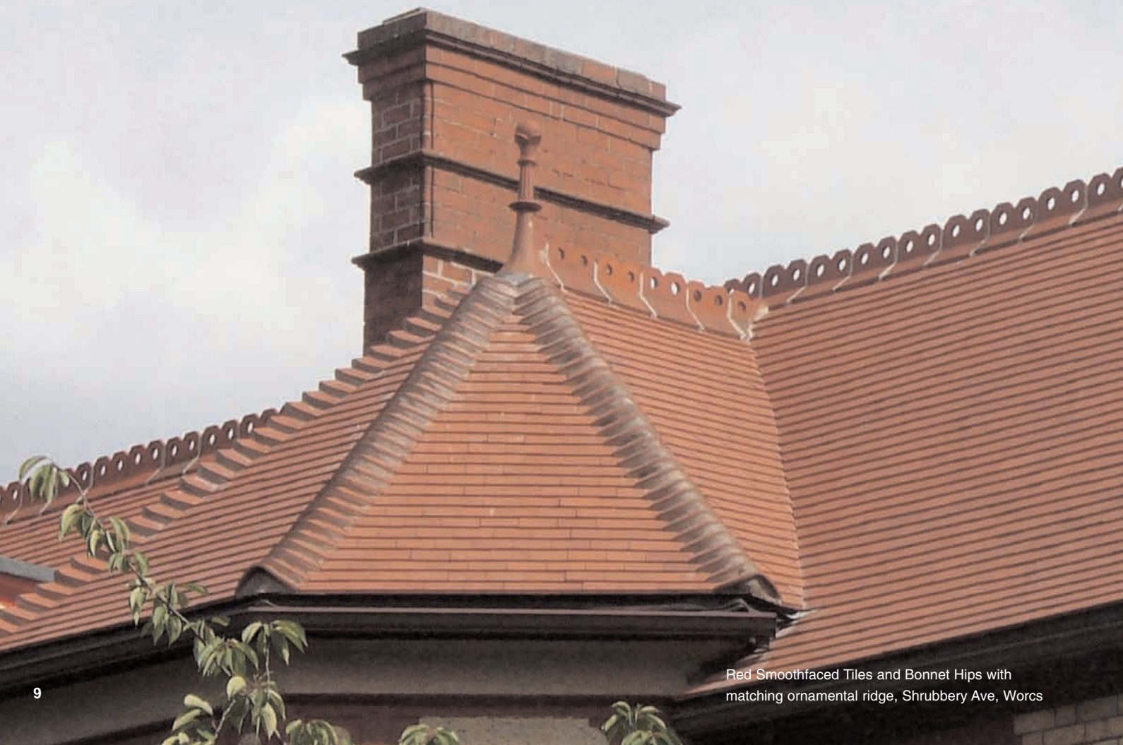
Red Smoothfaced Tiles and Bonnet Hips with matching ornamental ridge, Shrubbery Ave, Worcs